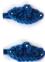
2ND DORSAL FINS