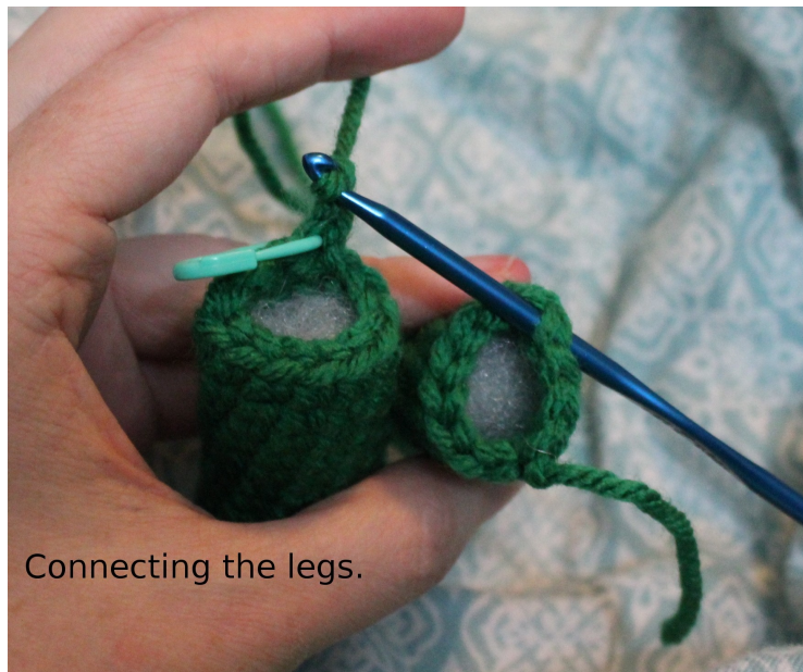
Connecting the legs.

Insert hook into a stitch from the first leg and pull through the ch 2 loop.