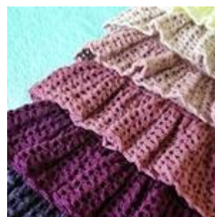
Ombre Ruffle Blanket