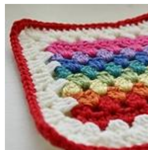
Granny Stripe Square