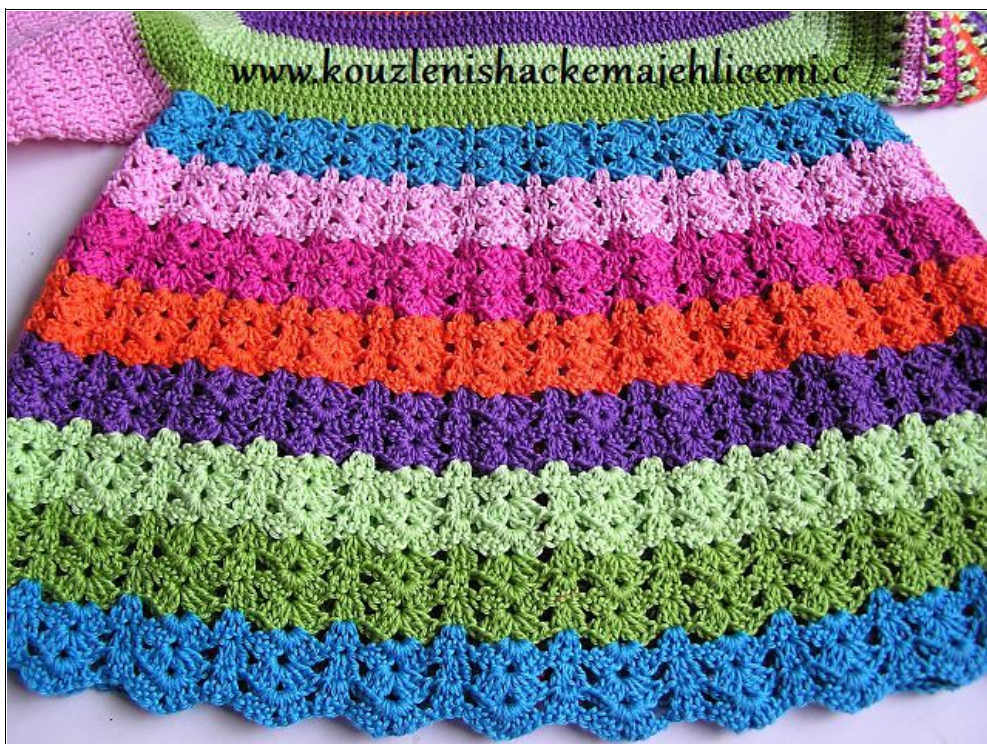
The Shell pattern in detail