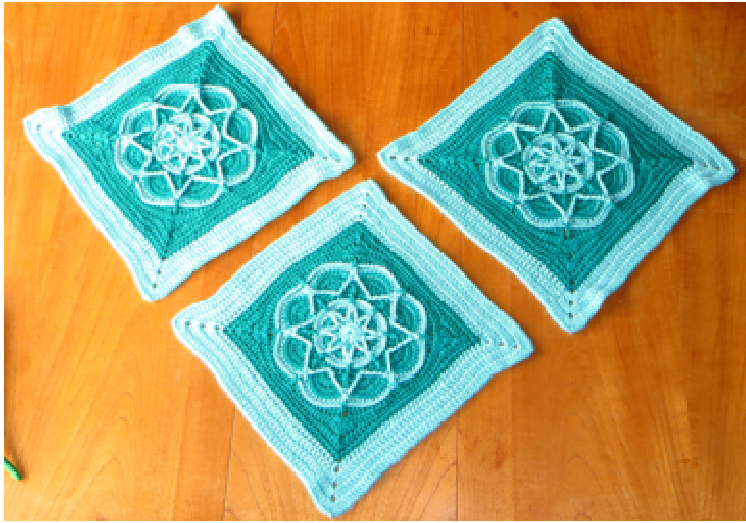
This shows the layout for the first 3 squares

Again with the joining you may choose what ever method you like, here I use the flat chain method, which I will explain. Personally I like the solid flat look of it with the more solid squares, but if you are using a lacy type square you may prefer a chain join or similar.